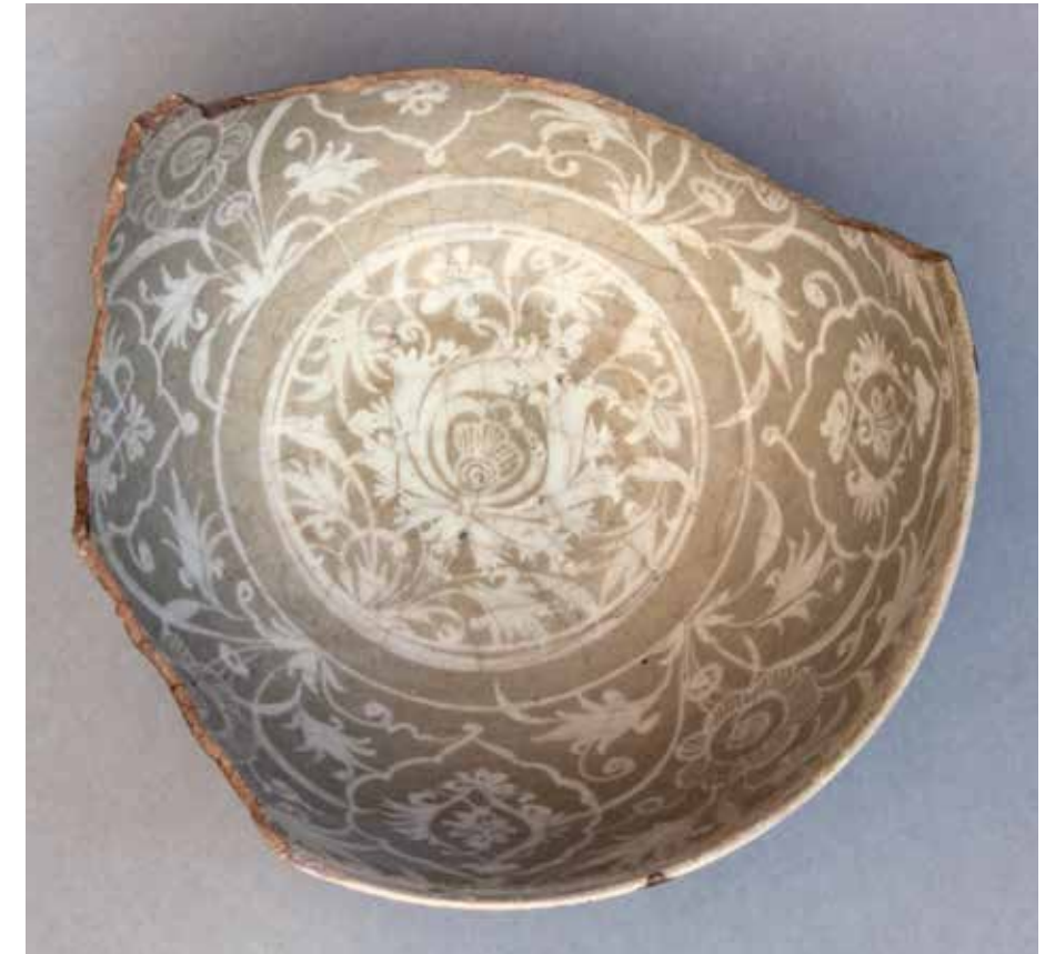
Cat. No. V2.9