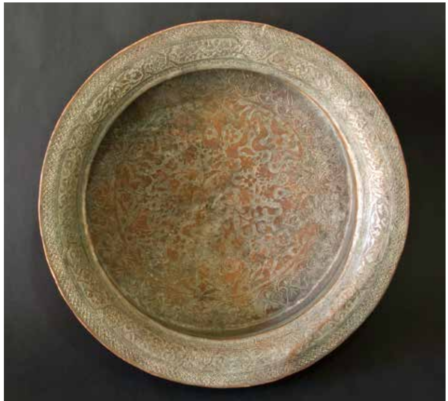
Cat. No. V2.1

The engraved decoration is composed of a large central field with a radiating pattern surrounded by a broad frieze. The field shows a cross-shaped composition of four cloud bands and scrolls placed against hatched background. This composition is framed by a lotus border. The decoration of the rim consists of an outer frieze with an interlace and an inner band containing cartouches and quatrefoil medallions, filled with flowers and scrollwork.