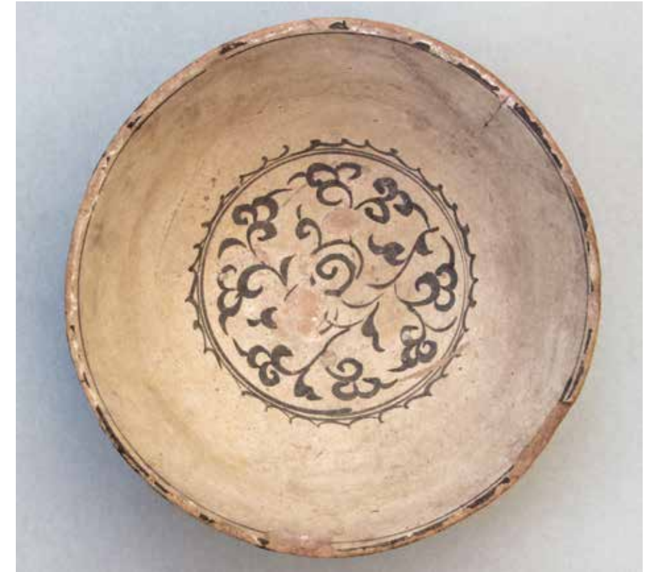
Cat. No. V2.8

Deep globular bowl with steep sides and low footring. Painted underglaze decoration inside and outside. Inside the surface is divided into a central roundel and a broad frieze on the wall. In the roundel, a lotus-style composite flower is depicted; in the cavetto alternating four poly-lobed medallions and rosette blossoms growing from a low stalk, flanked by two feathered leaves below and another three leaves above. The medallions are filled with two opposed split leaves framing a central blossom. The outer wall shows a broad frieze with large rosette blossoms entwined with a wavy scroll with feathery and three-petalled leaves. The colour and shape follow Chinese prototypes, particularly celadon stoneware.