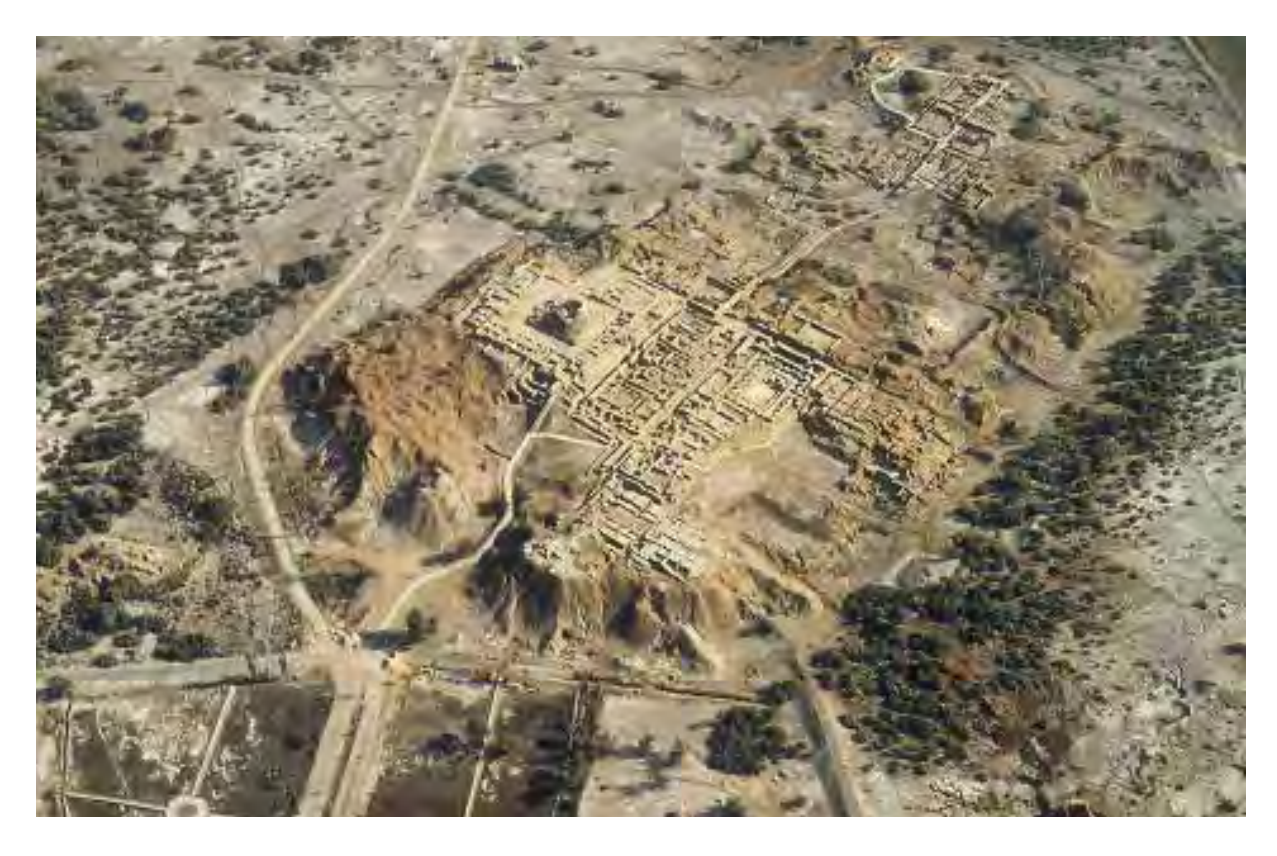
Fig. 12.1 Mohenjo Daro, aerial view of the citadel

The present chapters have shown that the culture complexes that formed about the early 3<sup>rd</sup> millennium BCE in Baluchistan and in Sindh represented an advanced phase in the genesis of cultural, social and economic development. The threshold that separates these communities from the transition to civilization has become lower in the past few years, yet it still exists, although in a distinct form (Fig. 12.1). In his extensive review of the developments during the Early Harappan Phase,