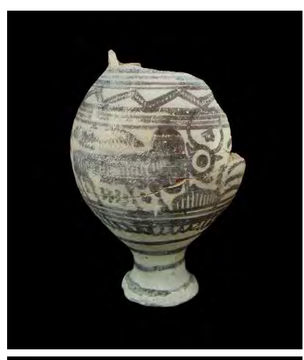
Fig. 12.6a Kulli Pot from Harambo near Nal