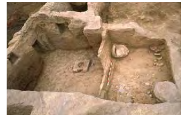
Fig. 12.15 House with niches, fireplace and pottery on the floor, Period IC