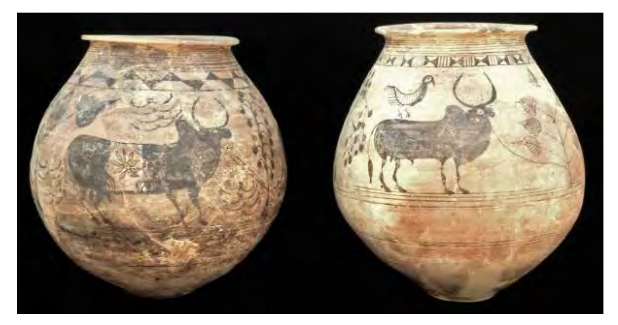
Fig. 12.16 Typical jars with bull in landscape, Period ID

As far as the ceramic assemblage is concerned, a certain continuity could be attested, as confirmed also by finds from Mehrgarh VIIc.9 These occupational layers represent the final stage of