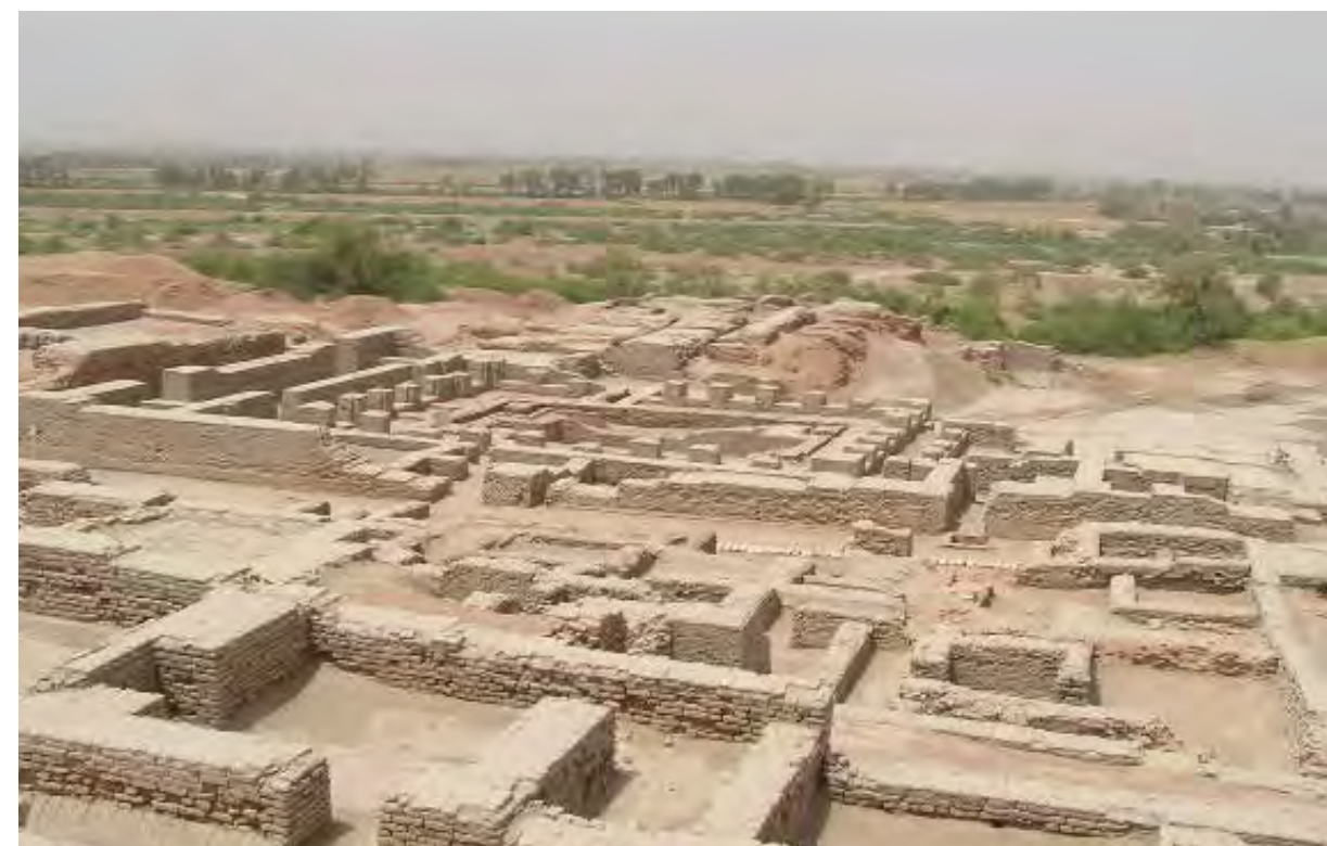
Fig. 12.3 Mohenjo Daro, view across the buildings