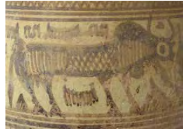
Fig. 12.9 Cat. no. 730, detail of bull design Fig. 12.10