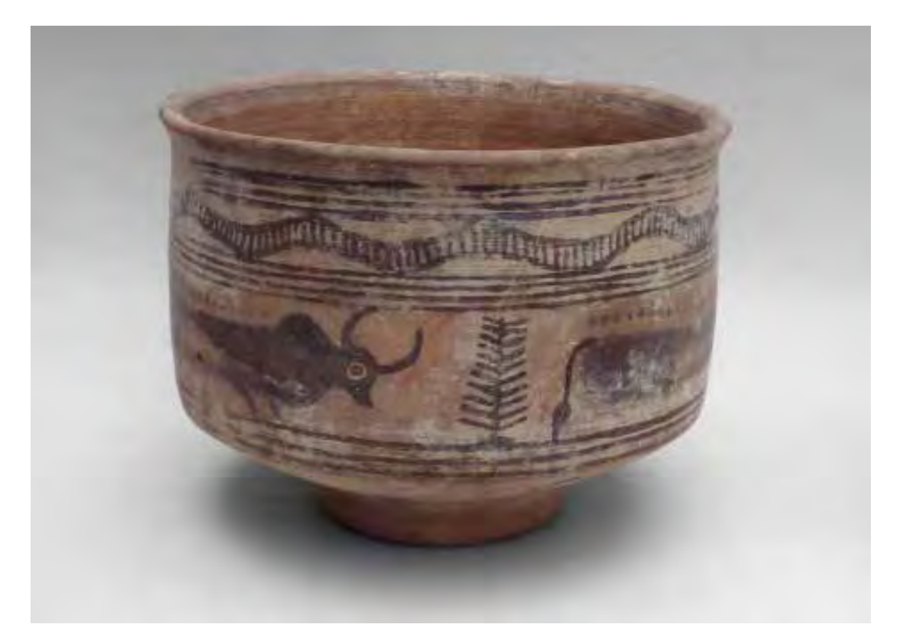
Fig. 12.8 Cat. no. 721, Kulli pot