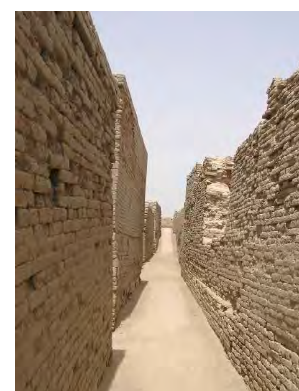
Fig. 12.4 Indus seal from Kinneru, Ornach

3 There is an enormous amount of literature on these issues, which cannot be acknowledged here. The most important synopses are Kenoyer 1998; Possehl 1999; Wright 2010.