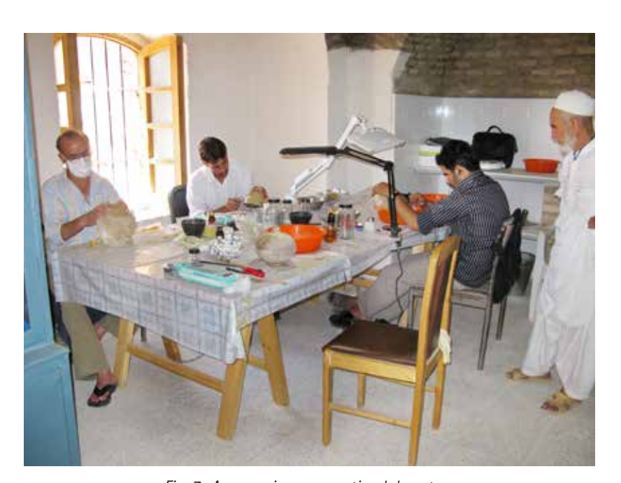
Fig. 7 Anorganic conservation laboratory

of 2011. Another constant input of objects to the museum is due to the increased attention of the police and customs who frequently confiscate illegal shipments in Badghis and Herat.