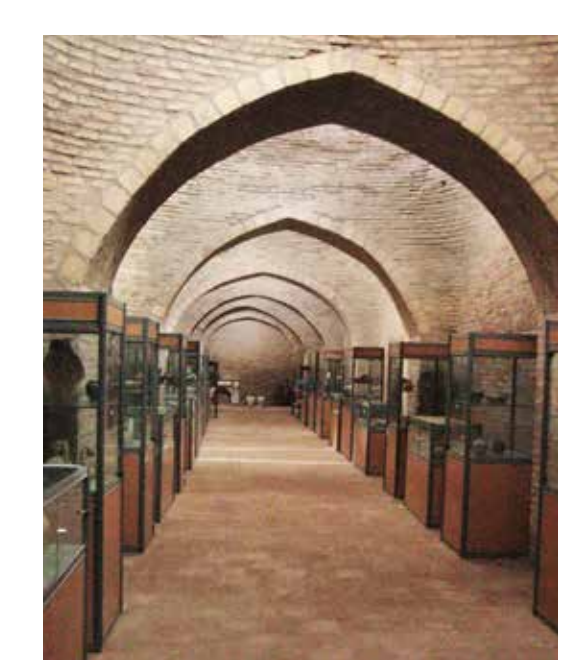
Fig. 3 Old museum in the citadel

while the Archive housed c. 250 manuscripts and books. Subsequently, it was decided to reinstall the exhibition. Prepared by the directors of the Museum and Archive of Herat, Gholam Yahya Khushbeen and Baha Timuri<sup>2</sup>, it opened at the end of 1383/2005. By 1384-85/2006, 117 manuscripts were registered. Following incidents of public unrest in the city, the objects were packed again and transferred back to the citadel in the winter of 1385/2006, after Qala'-e Ekhtyaruddin had been demined, cleared of the remains of war and handed over by the military to