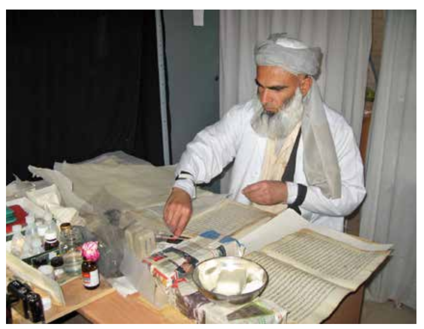
Fig. 6 Paper conservation area

Most objects needed to be cleaned, repaired and protected from further damage and destruction. Security was also an important issue, particularly since at the very beginning of the project in 2008, 23 objects from the Buddhist, Saljuk and Ghurid periods were stolen from the old building. Their retrieval in 2014 by the police and return to the museum was a major success in the ongoing fight against illegal trafficking of antiquities. In the process of establishing the new museum, the collection grew again to about 3100 objects in total through the collaboration with antiquity dealers in Herat, who dedicated more than 1000 objects to the museum when Wali Shah Bahra again became Director of Information and Culture in Herat, and upon the inauguration of the museum at the end