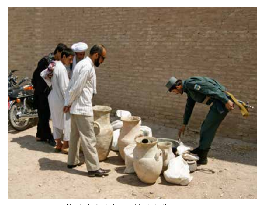
Fig. 4 Arrival of new objects to the museum

while the Archive housed c. 250 manuscripts and books. Subsequently, it was decided to reinstall the exhibition. Prepared by the directors of the Museum and Archive of Herat, Gholam Yahya Khushbeen and Baha Timuri<sup>2</sup>, it opened at the end of 1383/2005. By 1384-85/2006, 117 manuscripts were registered. Following incidents of public unrest in the city, the objects were packed again and transferred back to the citadel in the winter of 1385/2006, after Qala'-e Ekhtyaruddin had been demined, cleared of the remains of war and handed over by the military to