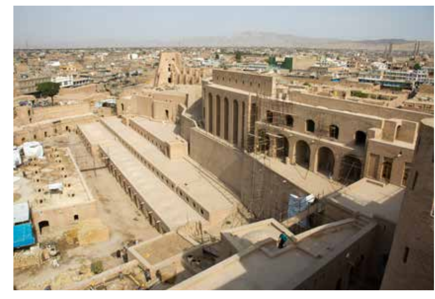
Fig. 1 Conservation of the citadel, Aga Khan Trust for Culture, 2009

At that time, its collection consisted of about 3000 objects from several historical