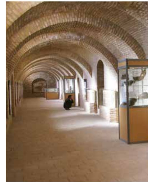
Fig. 5 New exhibition hall