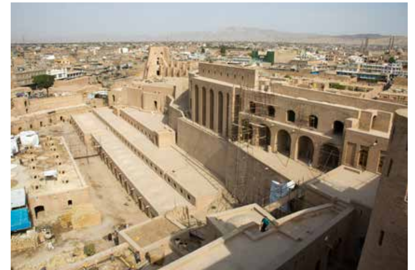
Fig. 1 Conservation of the citadel, Aga Khan Trust for Culture, 2009

At that time, its collection consisted of about 3000 objects from several historical