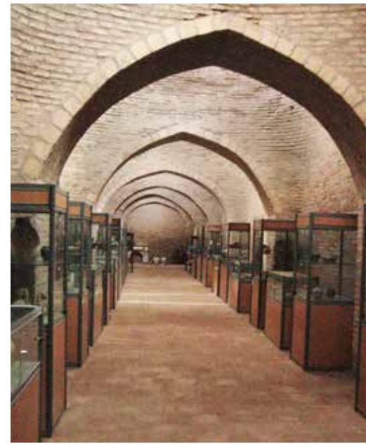
Fig. 3 Old museum in the citadel