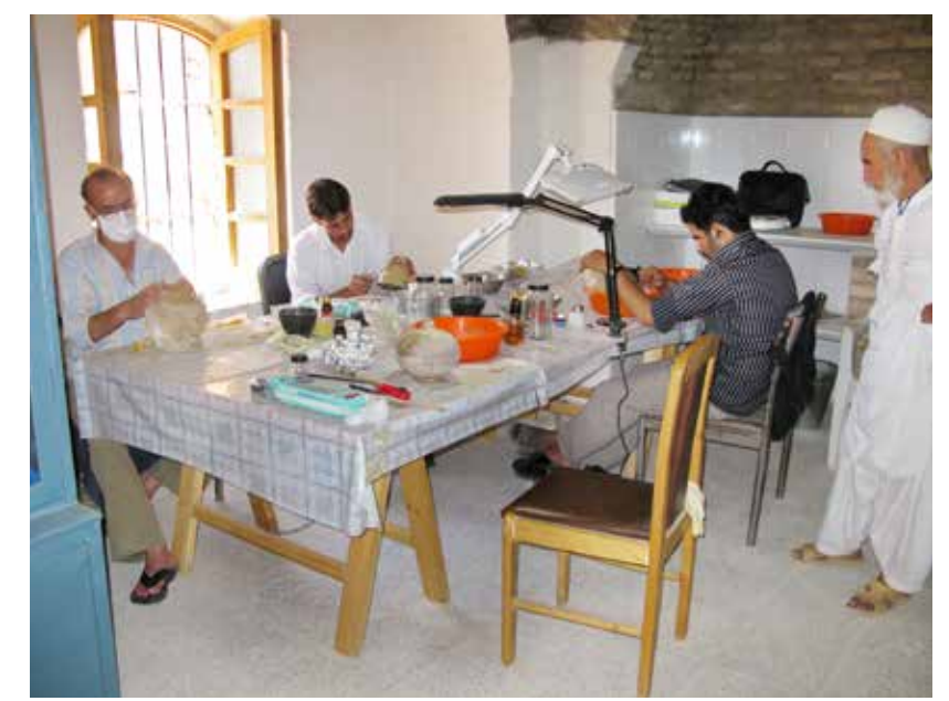
Fig. 7 Anorganic conservation laboratory

Most objects needed to be cleaned, repaired and protected from further damage and destruction. Security was also an important issue, particularly since at the very beginning of the project in 2008, 23 objects from the Buddhist, Saljuk and Ghurid periods were stolen from the old building. Their retrieval in 2014 by the police and return to the museum was a major success in the ongoing fight against illegal trafficking of antiquities. In the process of establishing the new museum, the collection grew again to about 3100 objects in total through the collaboration with antiquity dealers in Herat, who dedicated more than 1000 objects to the museum when Wali Shah Bahra again became Director of Information and Culture in Herat, and upon the inauguration of the museum at the end