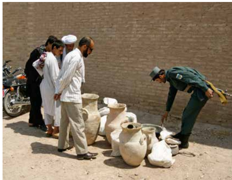
Fig. 4 Arrival of new objects to the museum

while the Archive housed c. 250 manuscripts and books. Subsequently, it was decided to reinstall the exhibition. Prepared by the directors of the Museum and Archive of Herat, Gholam Yahya Khushbeen and Baha Timuri 2 , it opened at the end of 1383/2005. By 1384-85/2006, 117 manuscripts were registered. Following incidents of public unrest in the city, the objects were packed again and transferred back to the citadel in the winter of 1385/2006, after Qala'-e Ekhtyaruddin had been demined, cleared of the remains of war and handed over by the military to