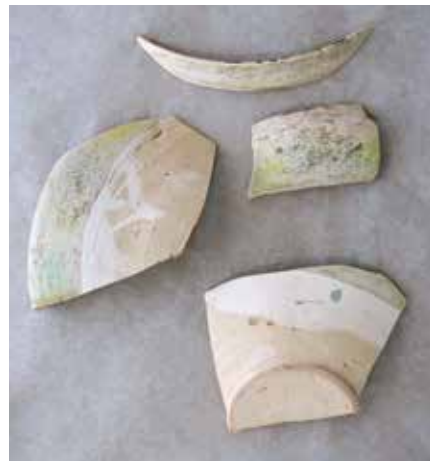
Cat. No. SP15