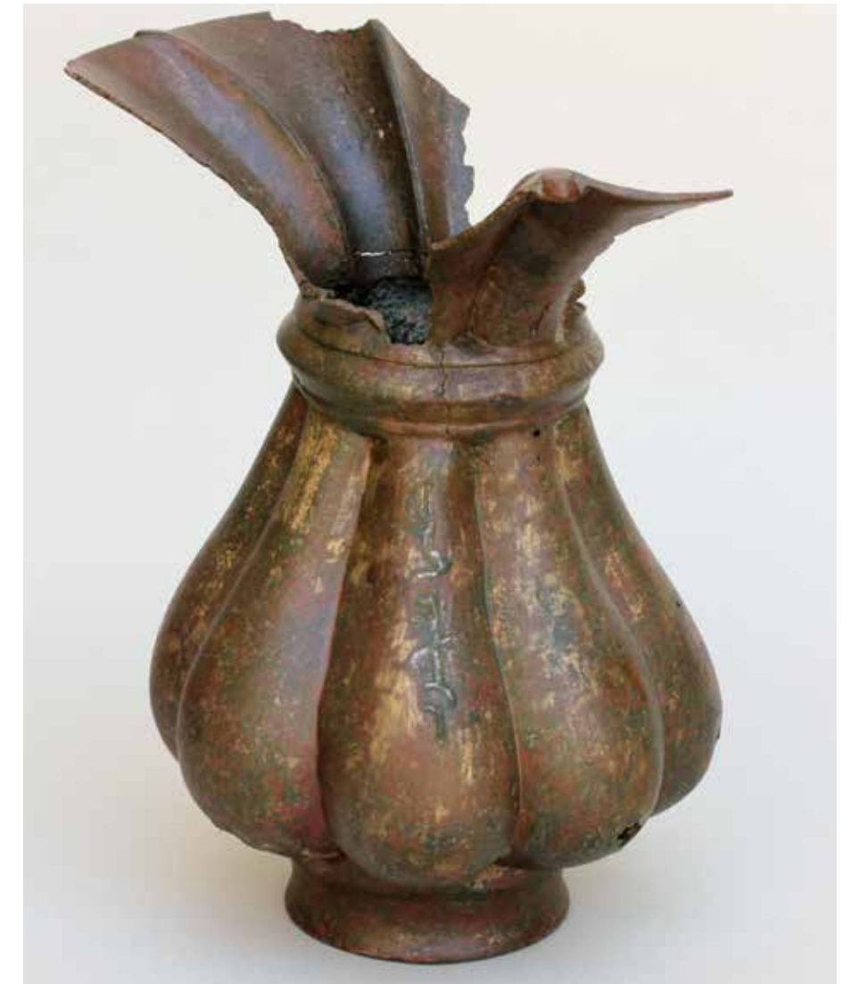
Cat. No. M51

Pierced openwork decoration around the body: foliated scrolls. Framed on the lower side by narrow frieze with strapwork.