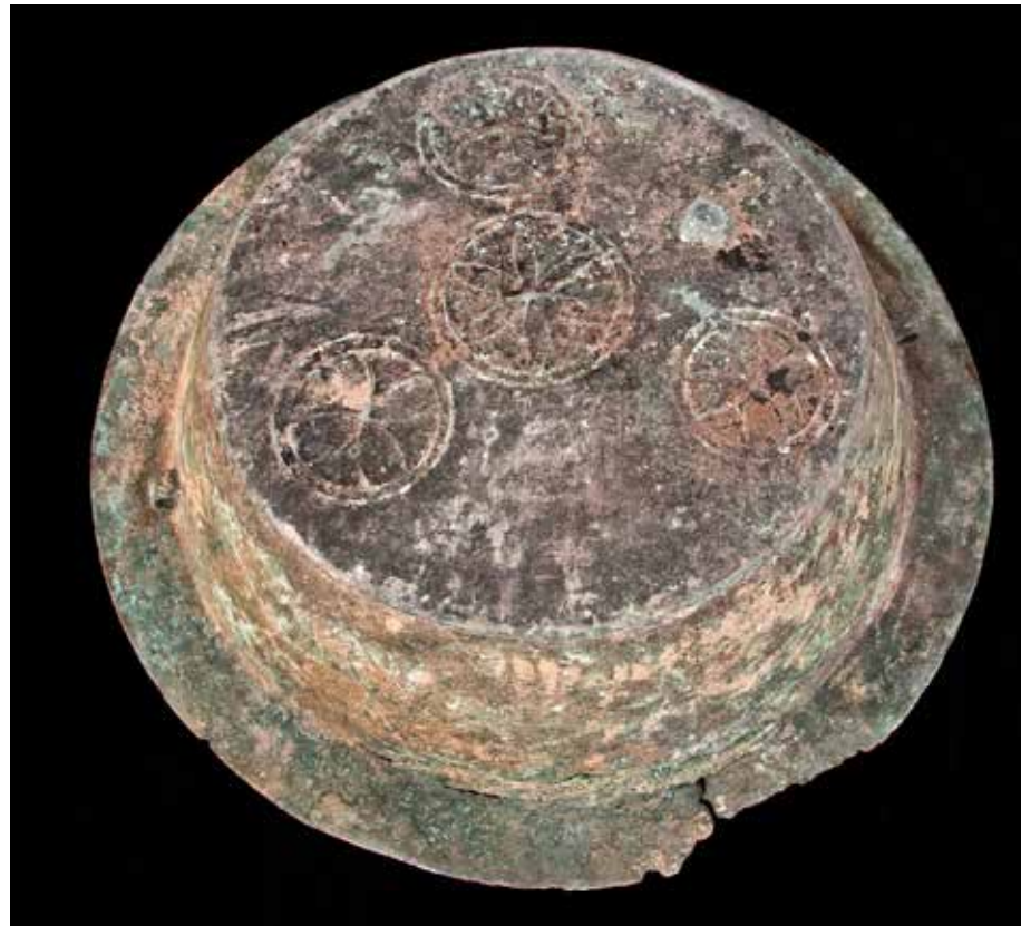
Cat. No. M23