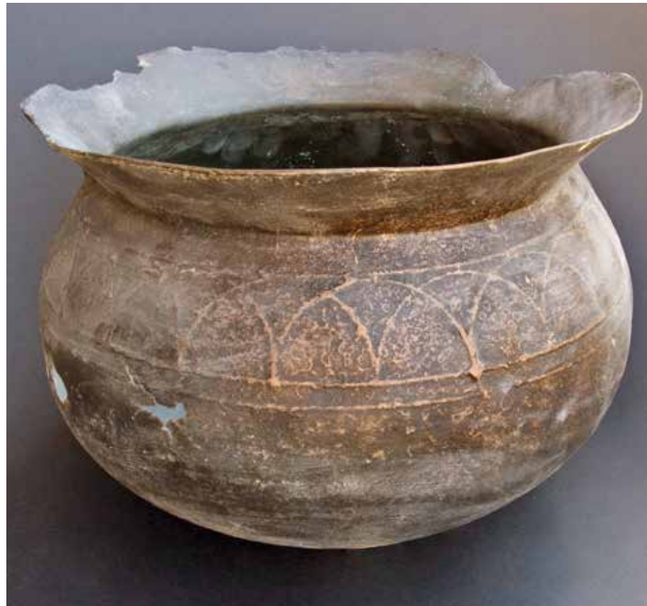
Cat. No. M29