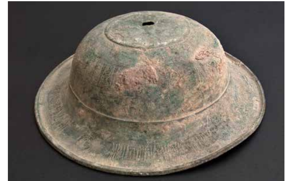
Cat. No. M54